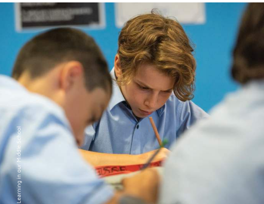
Learning in our Middle School

Values language as central to the development of critical thinking, which is essential for cultivating intercultural understanding and responsible membership in local, national and global communities. Language is integral to exploring and sustaining personal development and cultural identity, and provides an intellectual framework that supports the construction of conceptual understanding. All Middle School students undertake a compulsory language from Year 7 through to the end of Year 9.