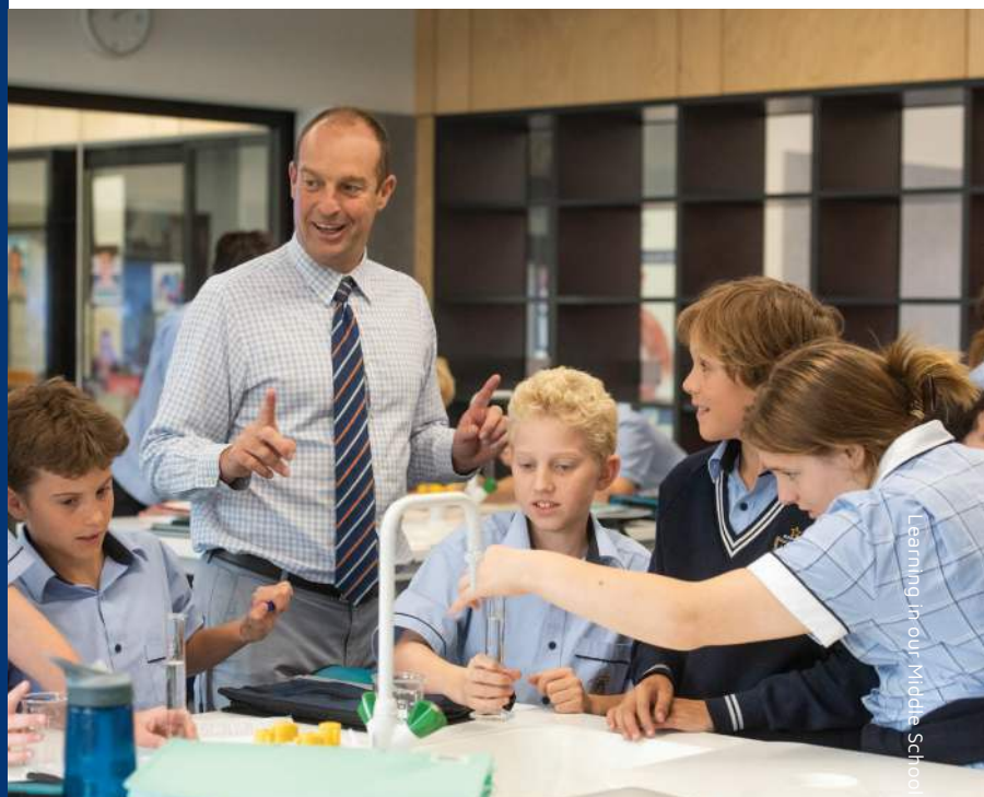
Learning in our Middle School

Fosters critical and creative thinking about research and design, as well as the identification of assumptions and alternative explanations. Students explore Chemistry, Biology, Physics and Earth Sciences, and are encouraged to investigate issues through research, observation and experimentation, working independently and collaboratively.