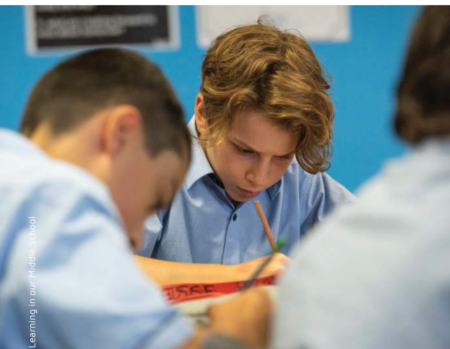
Learning in our Middle School

Values language as central to the development of critical thinking, which is essential for cultivating intercultural understanding and responsible membership in local, national and global communities. Language is integral to exploring and sustaining personal development and cultural identity, and provides an intellectual framework that supports the construction of conceptual understanding. All Middle School students undertake a compulsory language from Year 7 through to the end of Year 9.