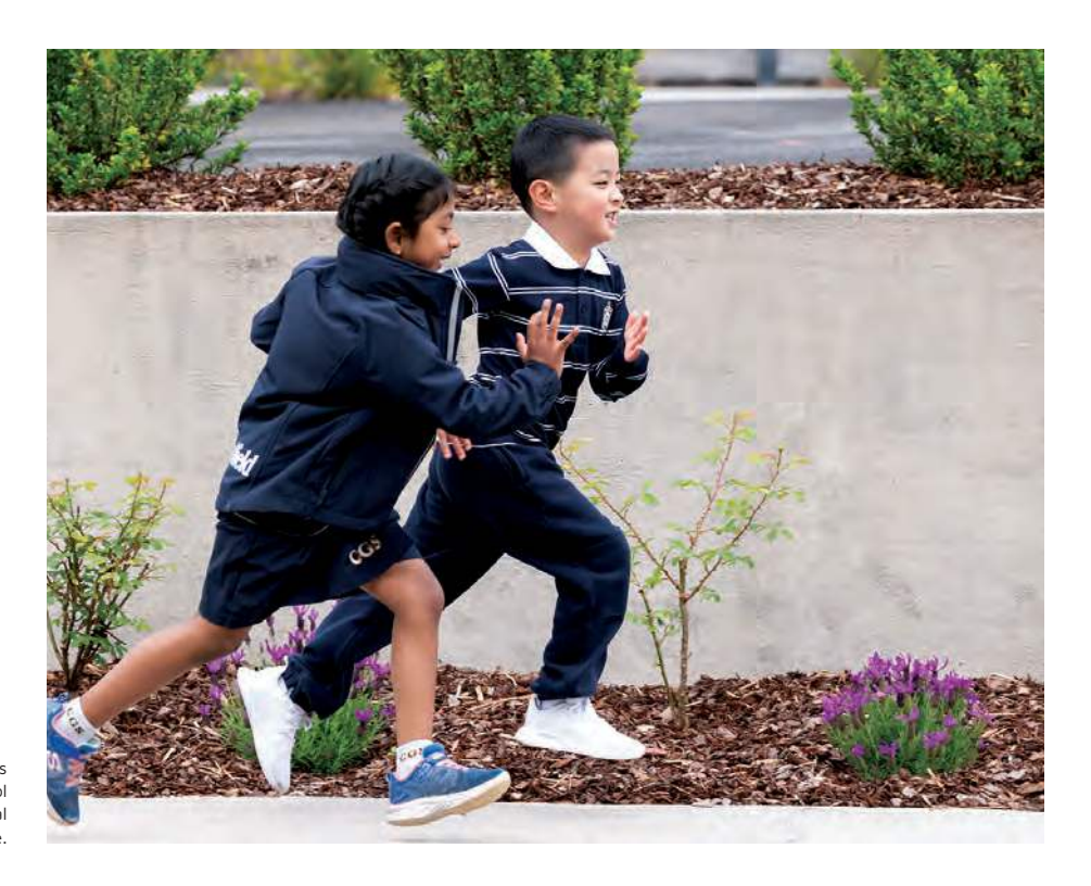
(Right and below) Our ELC students now have a uniform in keeping with School colours and style while still being functional and comfortable.