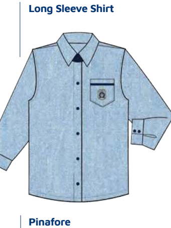
Available from Years 1-6